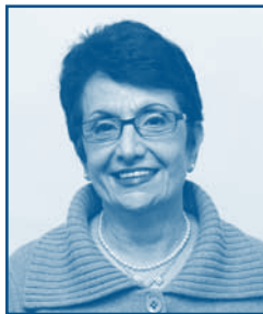
Beverly Trust Vice President Administration