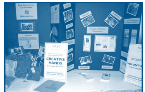
The Essex County Section exhibit shows off our many programs and services.